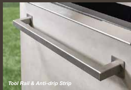
Tool Rail & Anti-drip Strip