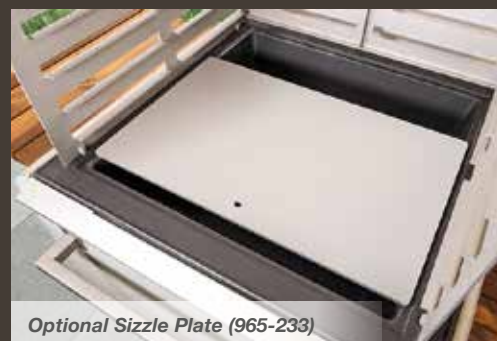
Optional Sizzle Plate (965-233)