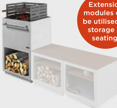
Air - BBQ Grill (965-010) Vertically configured with 2 x Extension modules (965-032), 2 x optional wooden tops (965-140) and 2 x optional wooden shelves for log store (965-199)

Extension modules can be utilised as storage or seating!