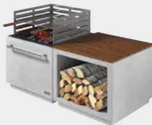
Air - BBQ Grill (965-010) Horizontally configured with optional wooden top (965-140)