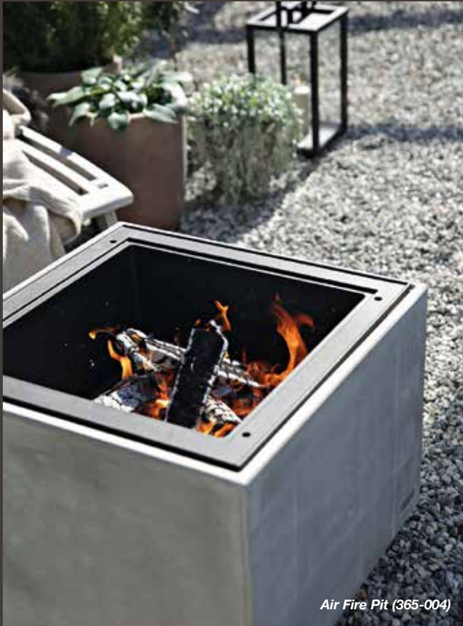
Air Fire Pit (365-004)