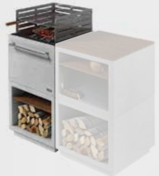
Air - BBQ Grill (965-010) Vertically configured with 2 x Extension modules (965-032), optional wooden top (965-140) and 2 x optional wooden shelves (965-199)

Extension modules can be utilised as storage or seating!