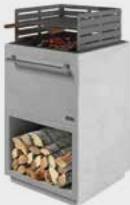
Air - BBQ Grill (965-010) Vertically configured.