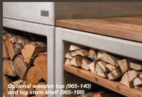
Optional wooden top (965-140) and log store shelf (965-199)