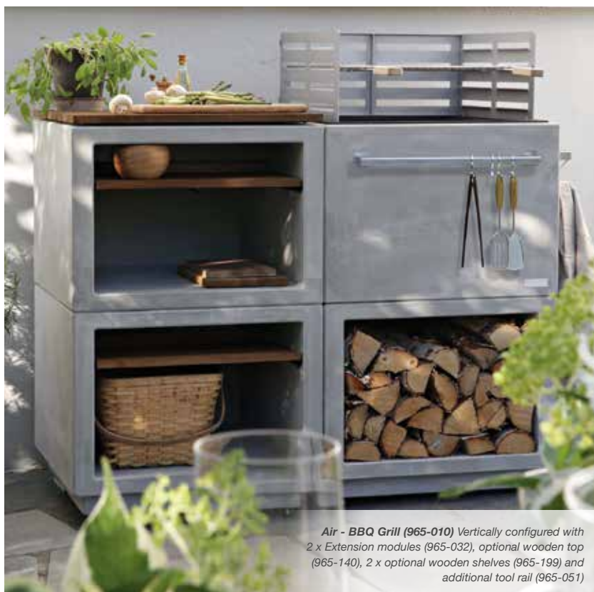
Air - BBQ Grill (965-010) Vertically configured with 2 x Extension modules (965-032), optional wooden top (965-140), 2 x optional wooden shelves (965-199) and additional tool rail (965-051)

Barbecue models come with a windbreak and steel grill for open-air cooking, plus a sleek steel tool rail for hanging those essential barbecue utensils. To keep your barbecue looking its best, a supplied protective anti-drip strip can be fitted with ease, keeping oil and food away from the concrete base. An optional sizzle plate (see bottom right) can be selected for a versatile cooking surface, while the extension modules can be used as a log store base for easy access to firewood to keep the heat going - or even configured for use as stylish bench seating in a horizontal configuration.