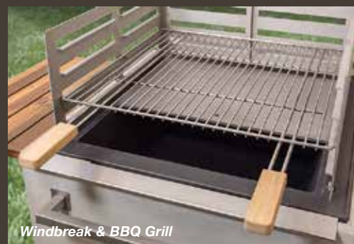
Windbreak & BBQ Grill